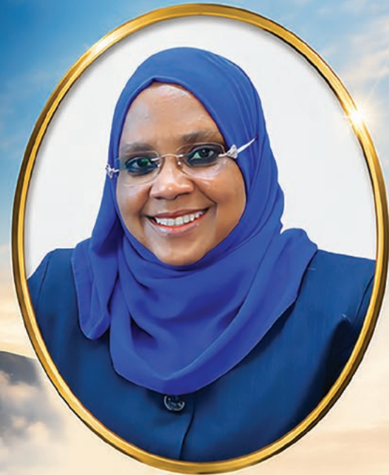
Hon. Dr. Ashatu Kijaji (MP) MINISTER FOR NATURAL RESOURCES AND TOURISM

MINISTRY OF NATURAL RESOURCES AND TOURISM