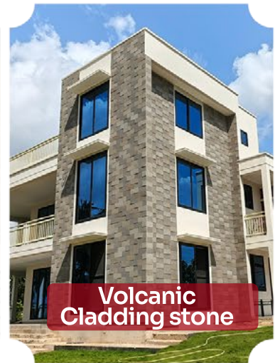
Volcanic Cladding stone