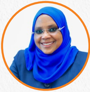
DR. ASHATU K. KIJAJI (MP) Minister of Natural Resources and Tourism

Dear Esteemed Guests and Participants, As the Minister for Natural Resources and Tourism, it is with great pleasure that I extend a warm welcome to all attending the distinguished KARIBU-KILIFAIR Tourism Expo. This important event provides a dynamic platform to spotlight the immense -and still largely untapped potential of our tourism industry. It offers an opportunity to showcase our rich and diverse tourism offerings while advancing sustainable growth in both domestic and international tourism markets. Tanzania stands as a land of extraordinary